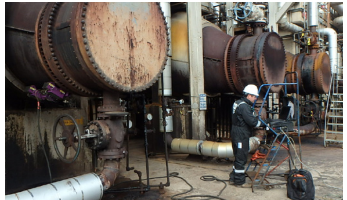
Heat exchanger, in-service corrosion mapping