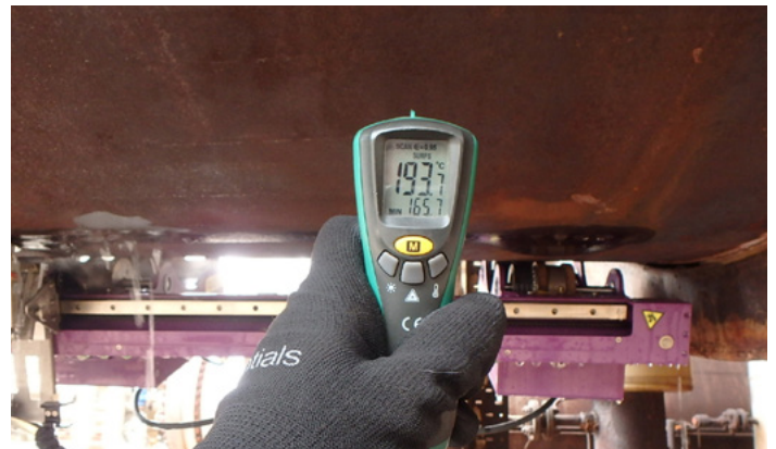
Elevated surface temperature