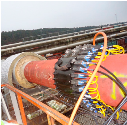
Figure 1 Heated transfer line at 90–100 °C (194–212 °F)

Guided waves were deemed a suitable inspection technique because the bitumen pipelines were elevated and insulated, which would require very extensive scaffolding and insulation removal for conventional NDT techniques to be used.